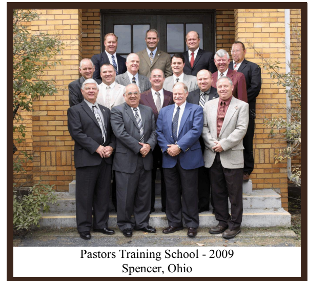
Pastors Training School - 2009 Spencer, Ohio

Thank you for your love for our Lord Jesus Christ and for your love for GSBM. By the grace of God, the various ministries continue to be effective. We fully intend to stand strong in the Word and true to our Lord Jesus Christ during these challenging times of turmoil and change. The church has always had to sacrifice in order to propagate the Gospel. Count it an honor and a privilege to do so now. I appreciate those who have confidence in my leadership and in the work of GSBM believing that we will not be blown by the winds of liberalism--both within and without the church. Please continue to pray for the ministries of GSBM to be spiritually effective. I am thankful for those who give and for those who pray.